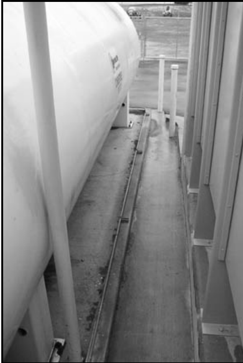
Photograph C. Backside of the Diesel Tank.