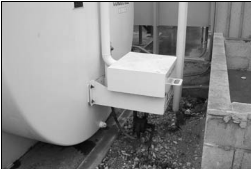
Photograph B. Diesel tank "fill box" with cover open.

From this location the fill valve is located on the left of the tank. When a truck parks on the road, the hose is connected to the tank.