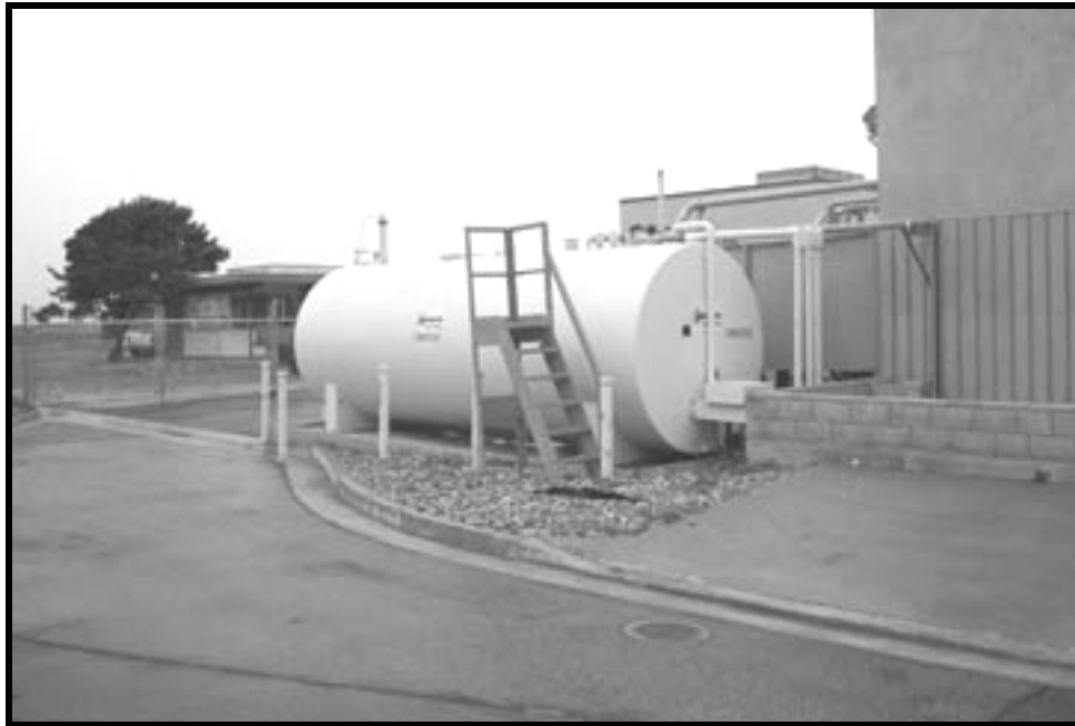
Photograph D. Electricity line that supplies power for the monitor and alarms.