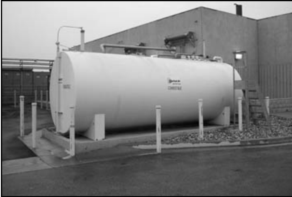
Photograph A. View of Diesel Tank From The Road.

From this location the fill valve is located on the left of the tank. When a truck parks on the road, the hose is connected to the tank.