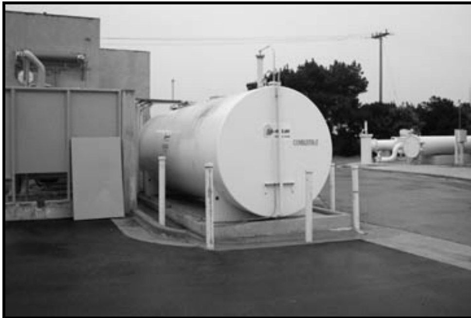
Photograph E. No caption.